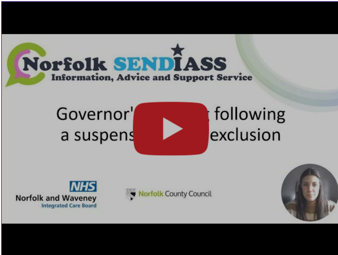
A short video explaining a bit about suspensions and exclusions from a place of learning

A short instruction video talking though how to complete a SEND35 form for appealing a refusal to issue a plan or appealing a final EHCP